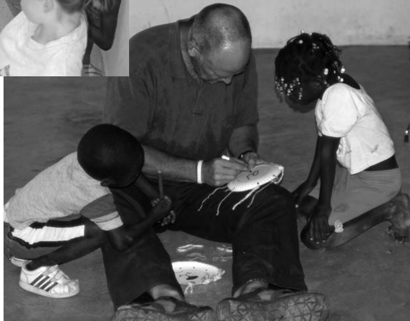
One of the young Dominicans showing off his lions face. The Bible school story was of Daniel and his faith and trust in God even though he was going to be thrown to the lions.