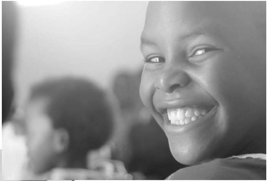
One of many smiles that captured our hearts.