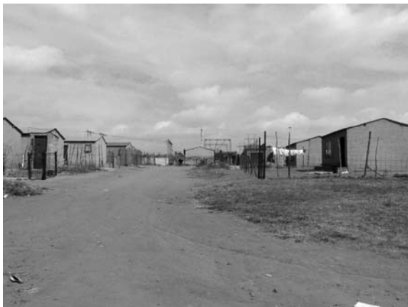
South African township of Tembisa.