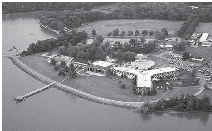
Sandy Cove Retreat Center